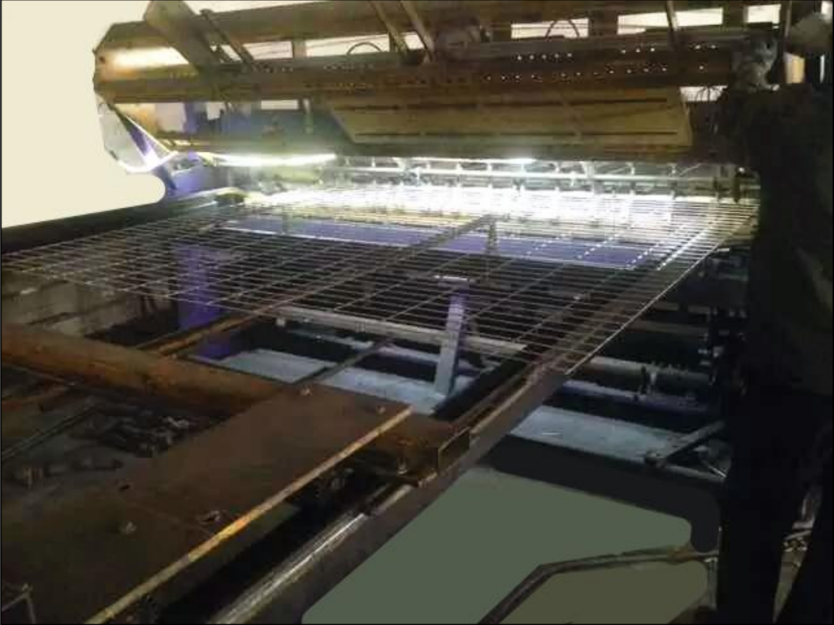
Mesh Panel Welding