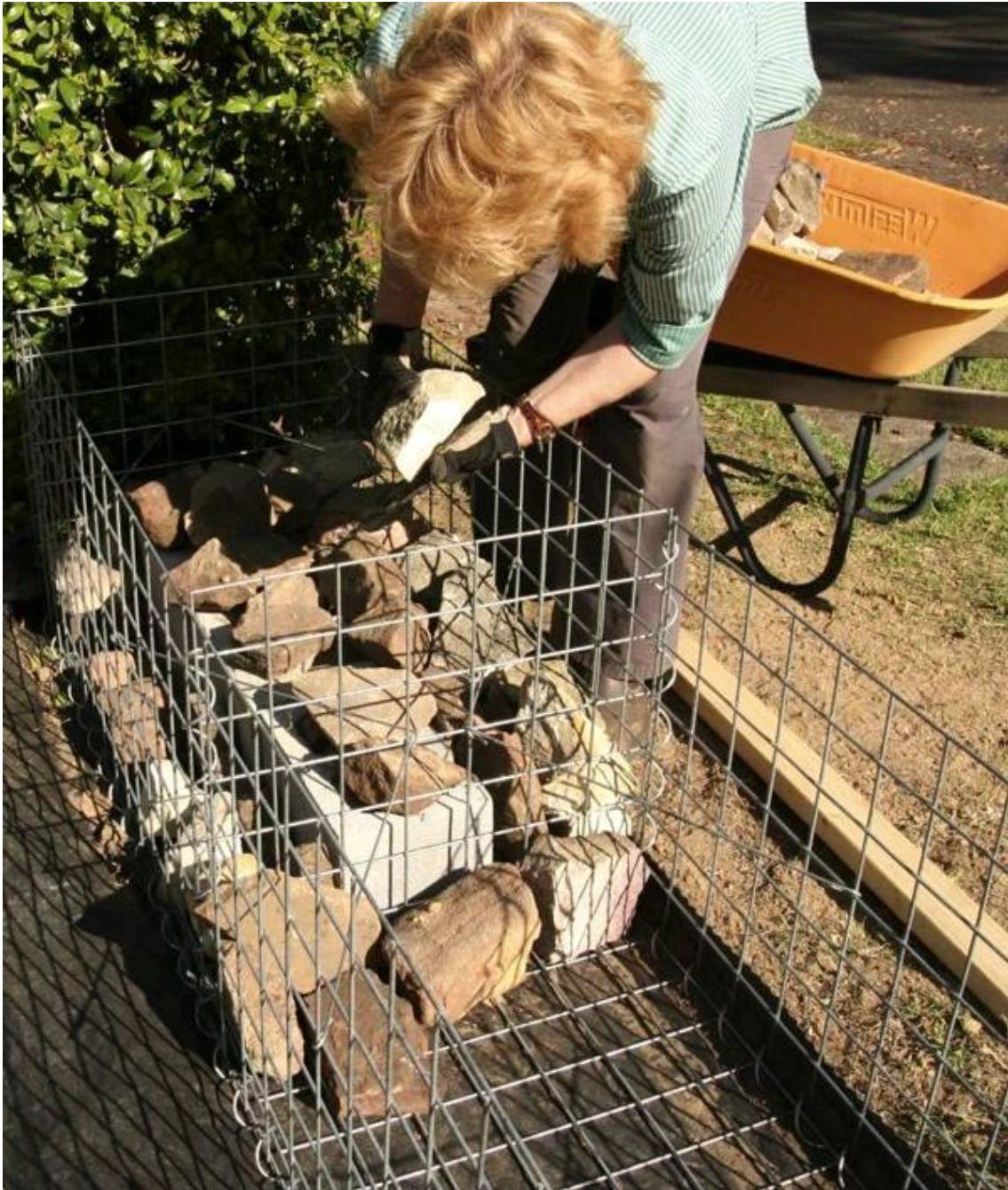
How to make a gabion seat?